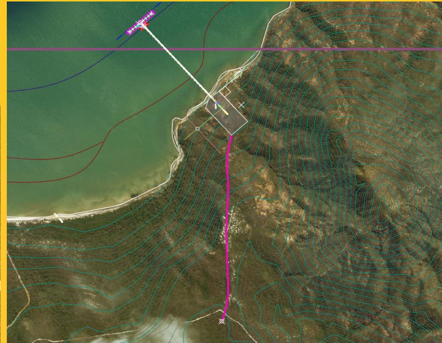
Cape Flattery headland – potential jetty and barge loading area