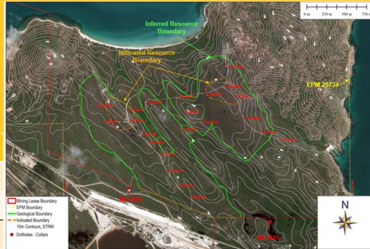
CFS Project – Eastern Resource Area – Surface Dune Boundary (green line)